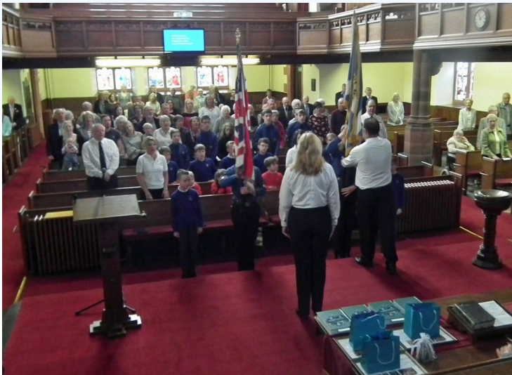
Boys Brigade service

Sunday Worship (held in the beautiful well-maintained sanctuary) is at 11.00am and the format includes the use of multimedia resources. Children of nursery and primary school age leave to attend Club Sunday. A Crèche for very young children is available though they are welcome to remain in Church throughout the service. Tea and coffee are served after the service affording time for fellowship in the newly refurbished church lounge. Donations taken for the refreshments are sent to our partners at the Kavuzi Clinic in Malawi.