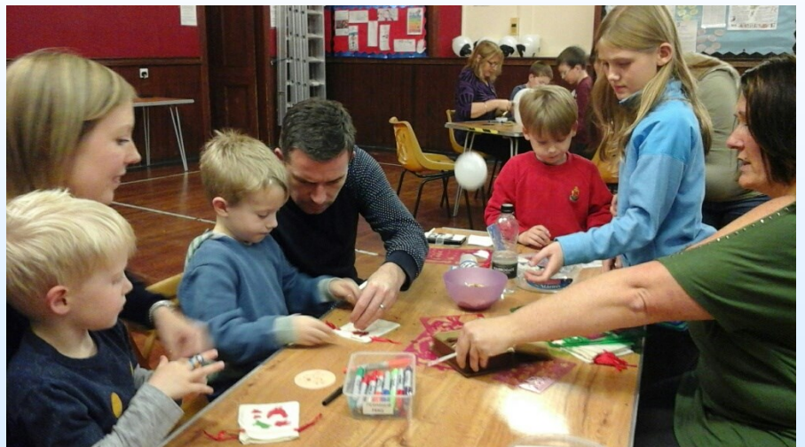
Role-playing Queen Esther and making money bags for the 'lost coin' at Messy Church