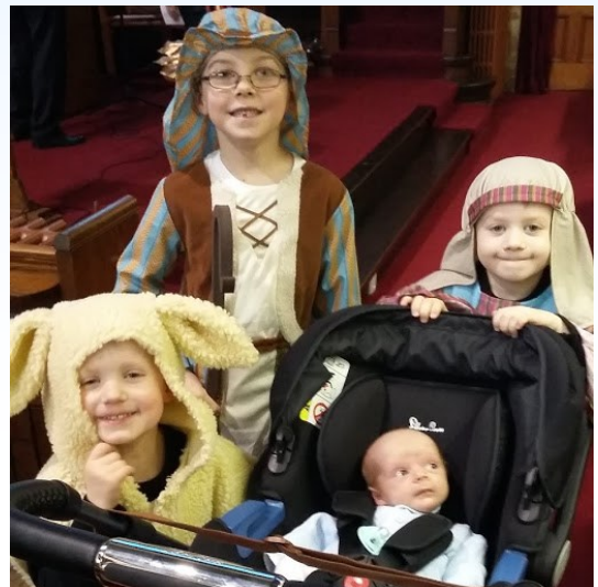
Some of the cast, posing after our Nativity

On the first Saturday of each month we have Messy Church where the church family engages in crafts, praise, games, socialising and interacting with a biblical theme. The activities conclude in the sharing of a meal together.