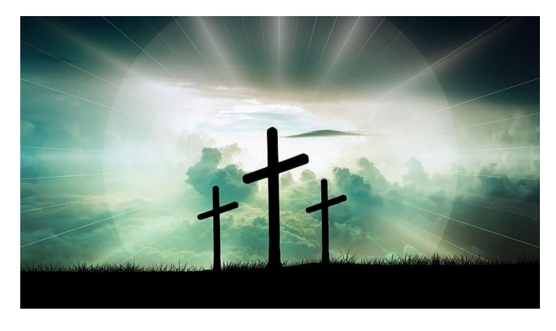
Topics are arranged over 7 days which you may find helpful

As we move through the Easter Season and look towards the summer. We take time to reflect on the 7 sayings of Christ as he hung on the cross.